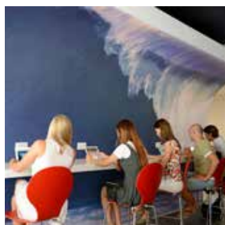
Students surfing the Internet

IELS Malta Institute of English Language Studies, Matthew Pulis St, Sliema SLM 3052, Malta